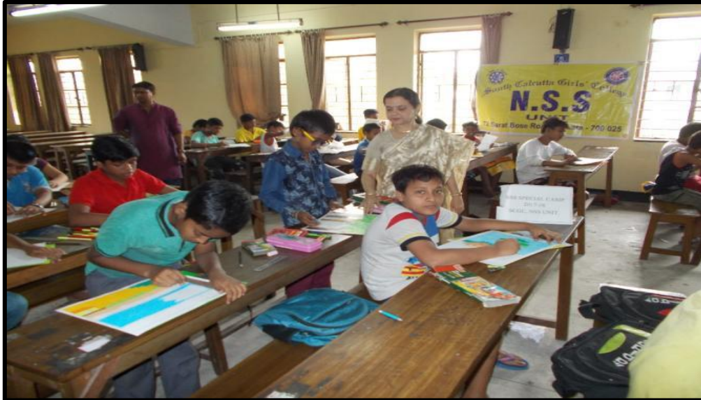
Sit and draw competition for slum children