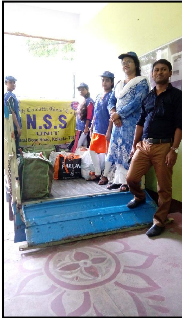
Kerala flood relief