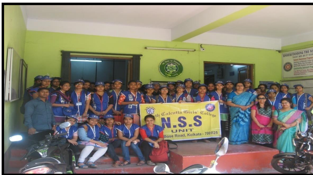
Day1: Students are Ready for Survey Work in Peyarabagan

The fact that a healthy mind resides in a healthy body is emphasized by the organization of medical camps by the NSS volunteers for the residents of Peyarabagan slum, where renowned doctors (general physician, child specialist, eye specialist, dentist, gynaecologist and psychological counsellor) dedicate their time to serve the community. Our association with the NGO, Ishwar Sankalpa has helped to raise awareness about the issues of mental health.