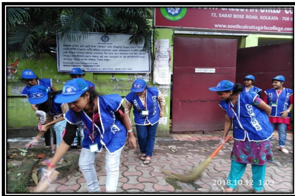
Cleaning of the College Campus on 12 th October 2018

The commitment of the NSS volunteers towards the community is complemented by their commitment to the environment, maintaining cleanliness and hygiene of the College campus and its vicinity. Their activities include disinfection of the College campus and spreading awareness among the residents of the Peyarabagan slum about the necessity of maintaining cleanliness, hygiene, environmental sustainability and preventing vector-borne diseases. Every year, NSS volunteers undertake comprehensive activities towards cleanliness and disease prevention through cleaning of the college campus; door-to-door campaign for Dengue awareness; discarding water accumulation; spreading of bleaching powder and other disinfectants to prevent water-borne and vector-borne diseases which are very common during this time of the year.