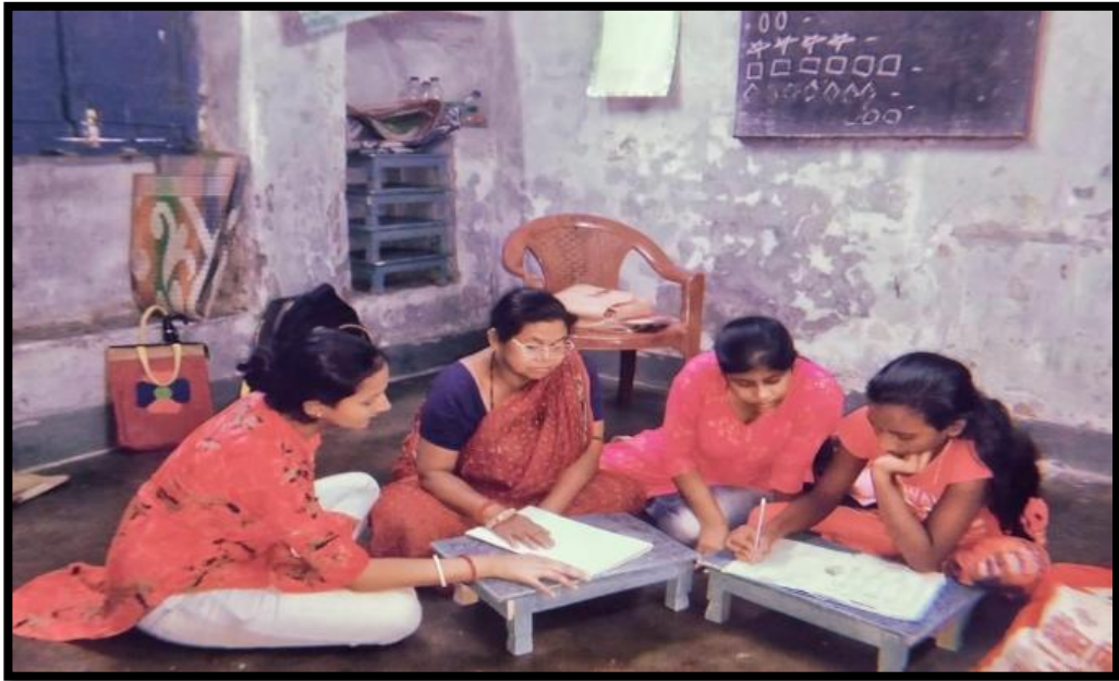
Adult Literacy class in progress