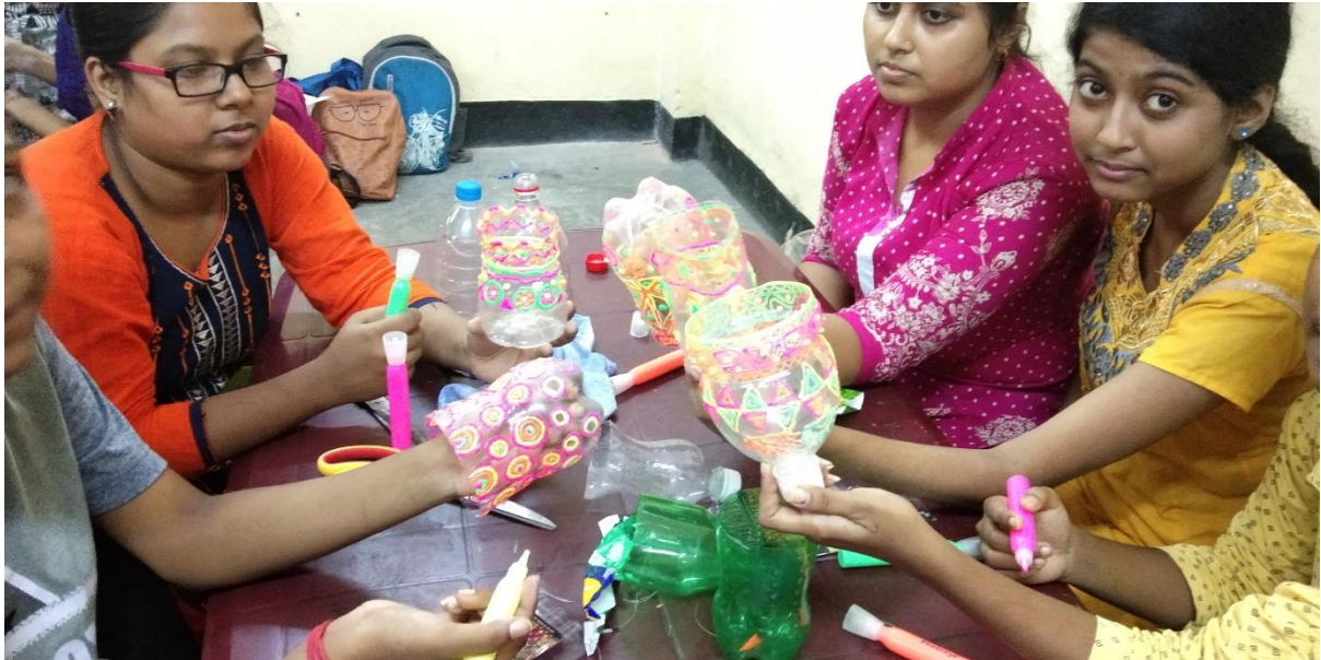
Students displaying the items made