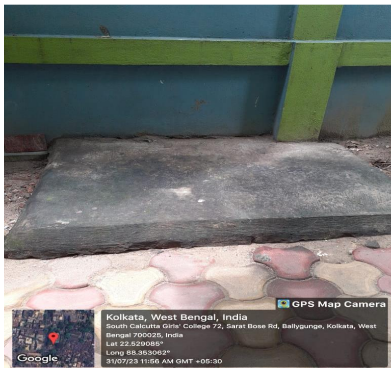
PIT FOR CHEMICAL LIQUID WASTE