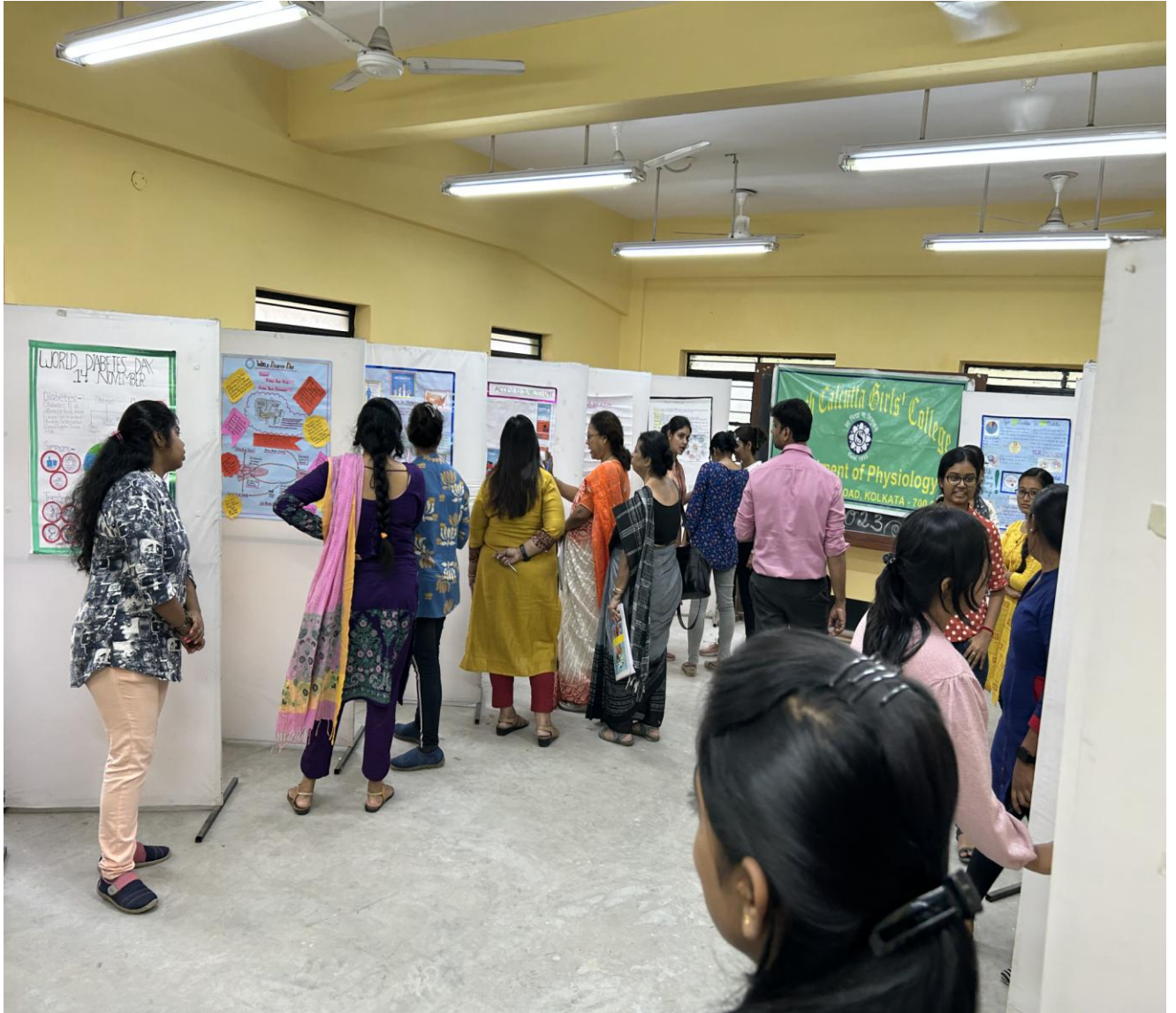
Students Participation in Poster Competition in World Diabetic Day