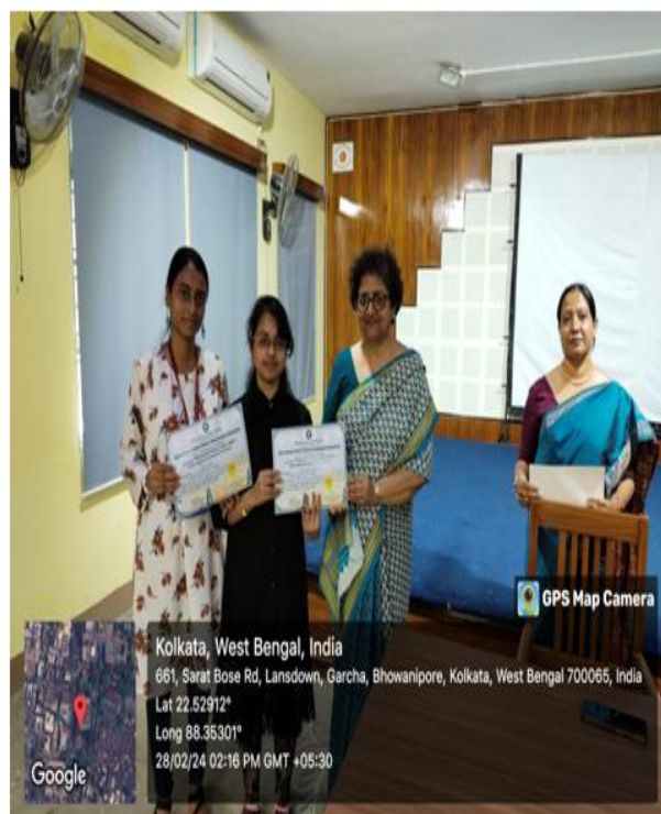
Students participation in Inter College Poster Competition in National Science Day