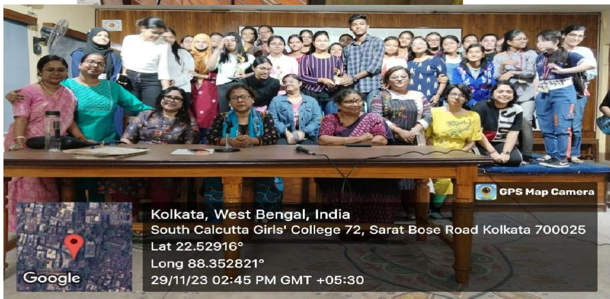
Intra College Debate Competition on "Social Media is Destroying Creativity"