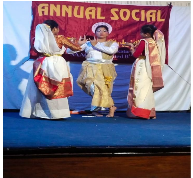
Students participating in cultural programme of Annual Social