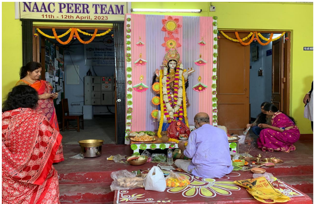
Students in Saraswati Puja