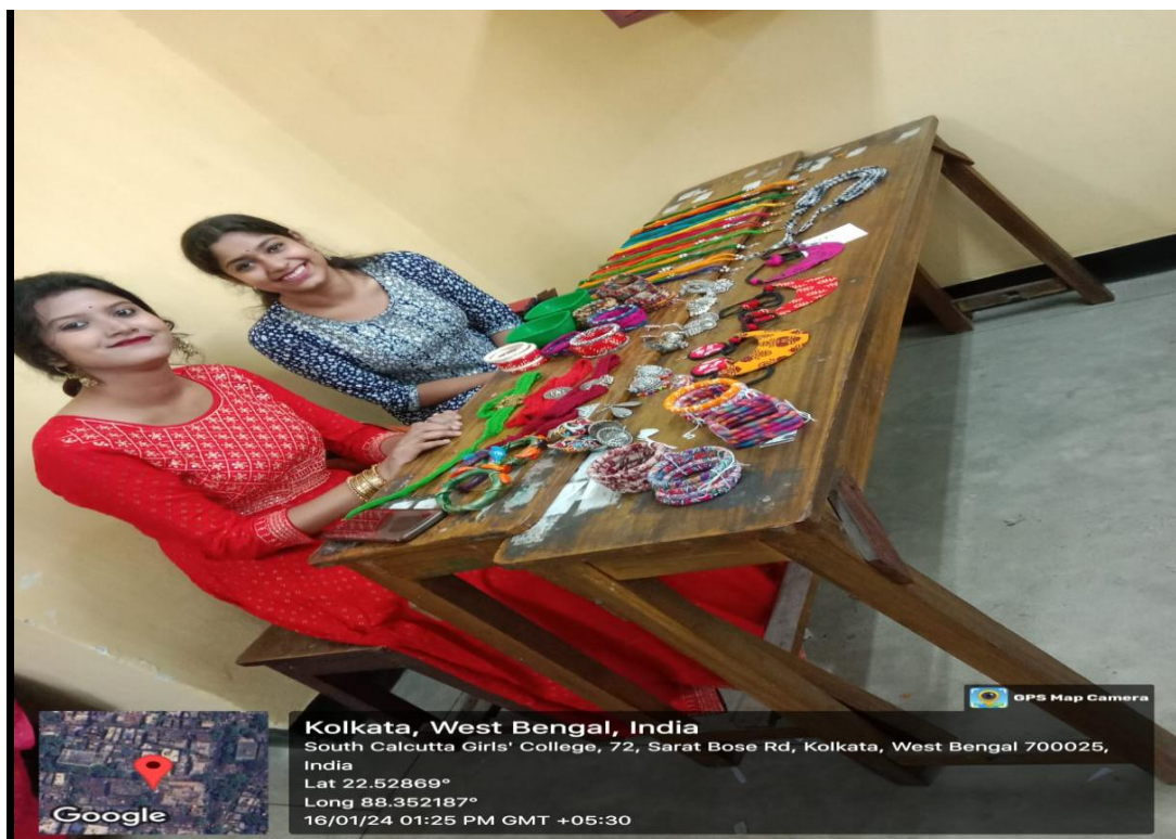
Students are participating in an exhibition with their hand made products